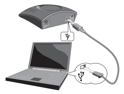
Figure 2 - Connecting to a PC

Use the included USB 2.0 cable to connect the CHAT 50 to your PC (Figure 1).