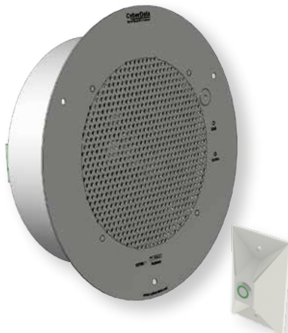
Included remote call button: 011185, RAL 9003